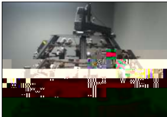
Figure 2: RTI in Digital Lab at Yale University West Campus

Another series of stacked photos were taken using a polarized lens and a thin layer of ethyl alcohol over the fossil, which brings out any chitin that may be in the fossils. Photos were prevent the alcohol from evaporating before the photos were complete. The stacks were then combined using the same Horizon™ program..